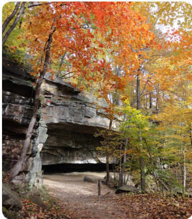
Old Maid's Kitchen (a.k.a. Mary Campbell Cave)

Highbridge Trail continues west to Cascade Valley Metro Park